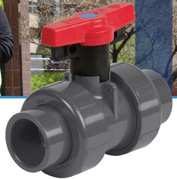
2000 Series Industrial Ball Valve